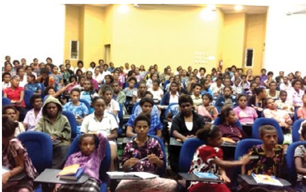
210 girls attended Real Beauty - Central Papua Conference