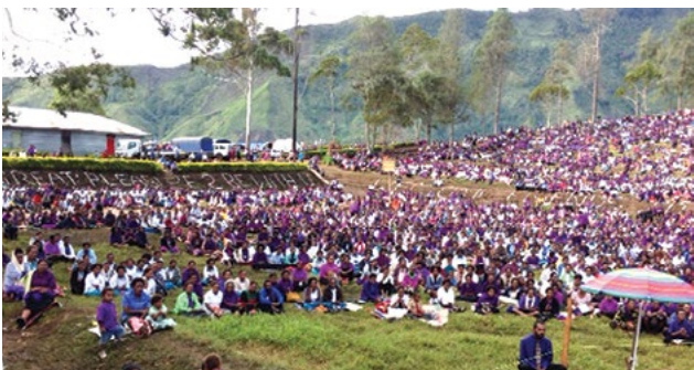
20,000 ladies attended the Adventist Women's Congress, Yani, Eastern Highlands Simbu Mission

REACH ACROSS - Train more women in leadership and Mentor younger women.