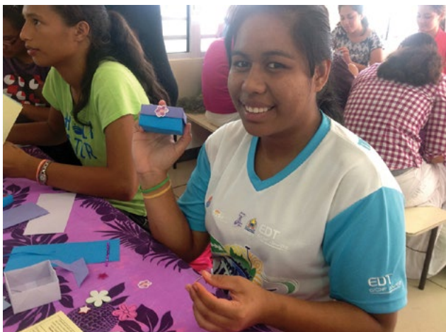
85 girls attended Real Friends in Tahiti