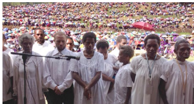
35 ladies were baptized at the Congress

We want to continue to encourage our women to share their faith with others through the gifts that God has given them.