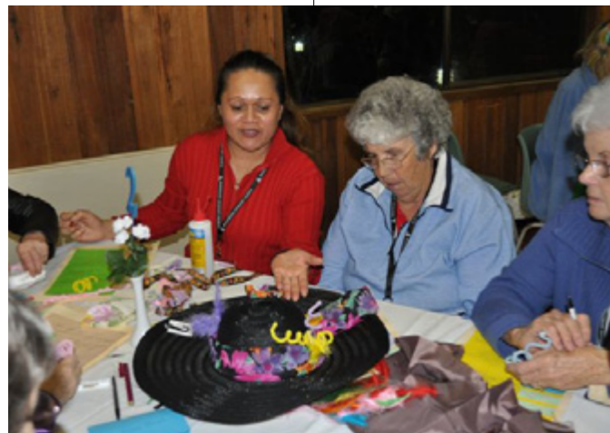
Ladies having fun at the progressive tea

One hundred and ten women attended the women's retreat at Yarra and the spirit was really wonderful. Saturday night was one highlight where we had a progressive tea with a difference. Everyone mixed and went from table to table in a group and did a different activity, it was lots of fun.