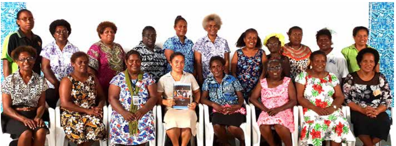
The facilitators/counsellors for Real Me.

We need more women to take on the passion of organising such events for teenagers across the Division, conducted in languages of the areas.